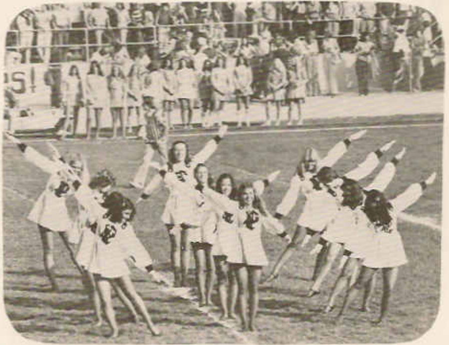
The Pirettes perform one of their routines supporting this year's football team.

igh Los Altos's defense in a challenging an 8-2 record just barely missing a wild ran were named Northern All Stars and l Star Football Game, Aug. 4.